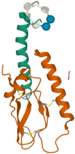
Gastric inhibitory polypeptide (GIP)